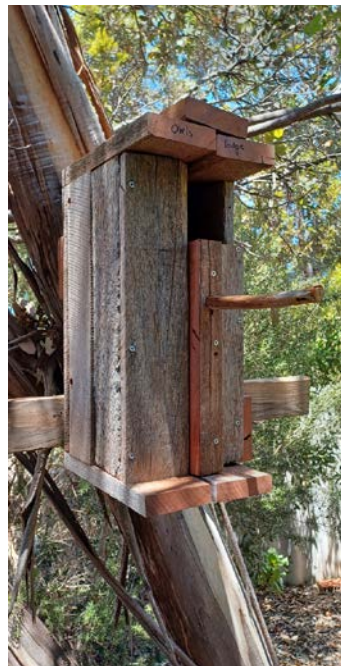
■ Owl Lodge insitut.