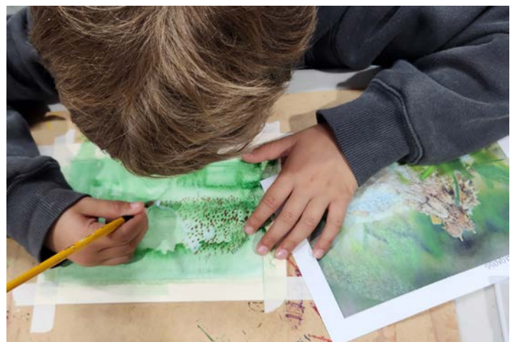
■ Marine Art Study.