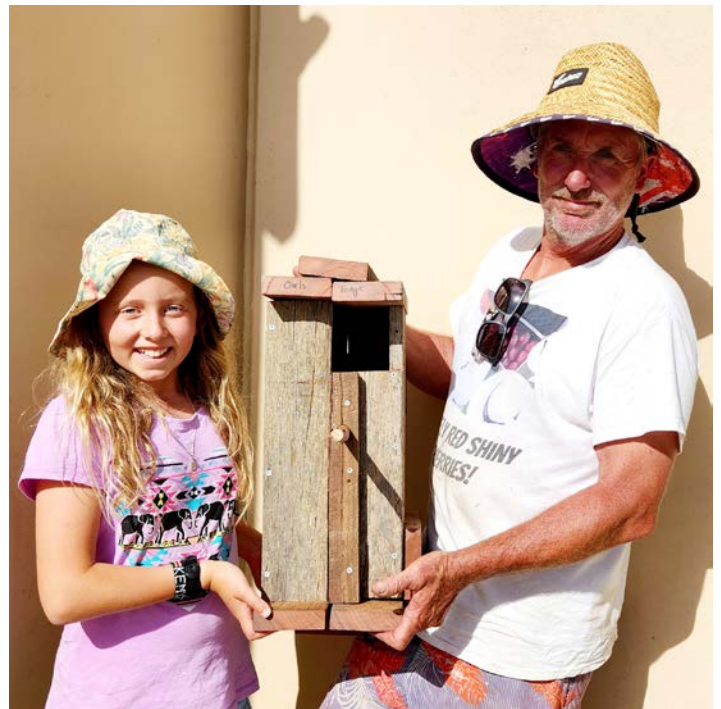
■ Leilani's Owl Lodge.