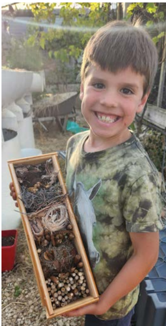
■ Fraser's Bug House.