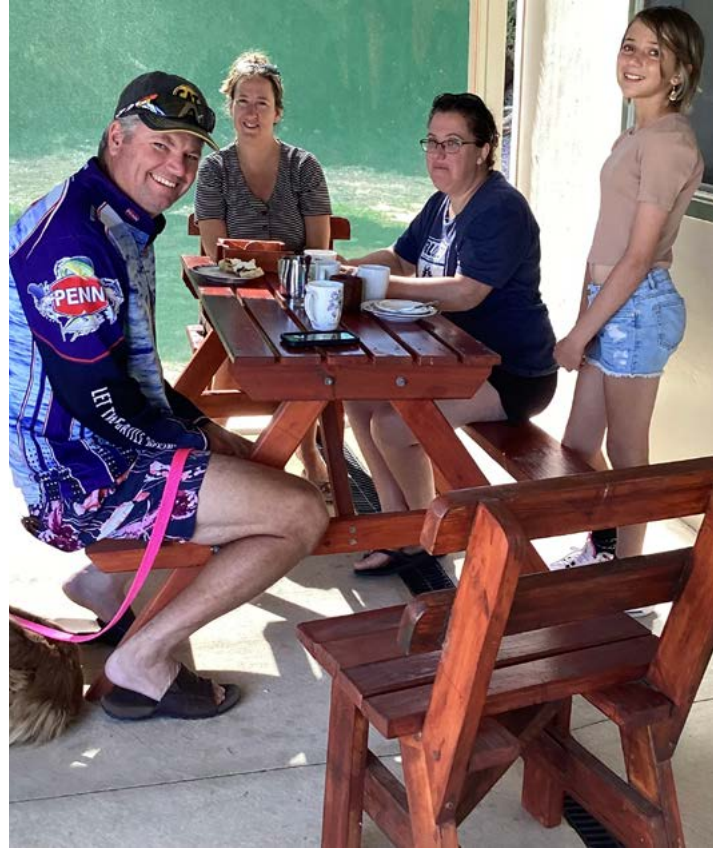
■ Easter morning teas.