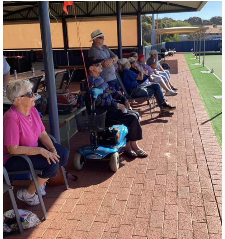
■ Watching the final.