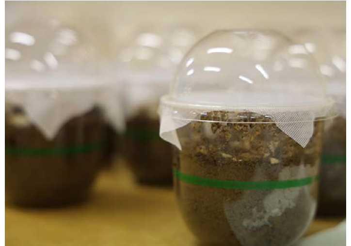
■ GRDC continues to invest in snail research to ensure a pipeline of solutions to manage the pest.