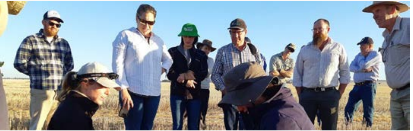
■ CSIRO researchers with members of the National Mouse Group visiting a field site.