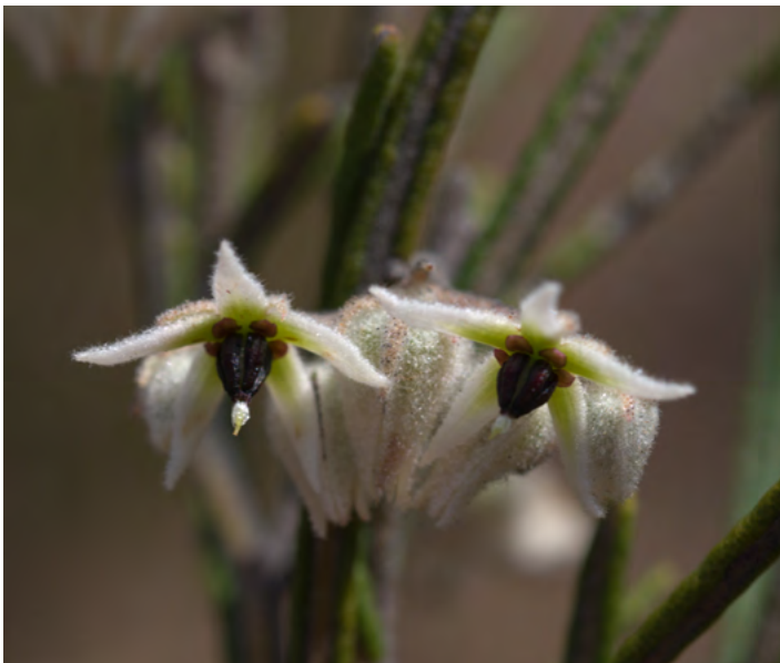
■ Lasiopetalum rosmarinifolium