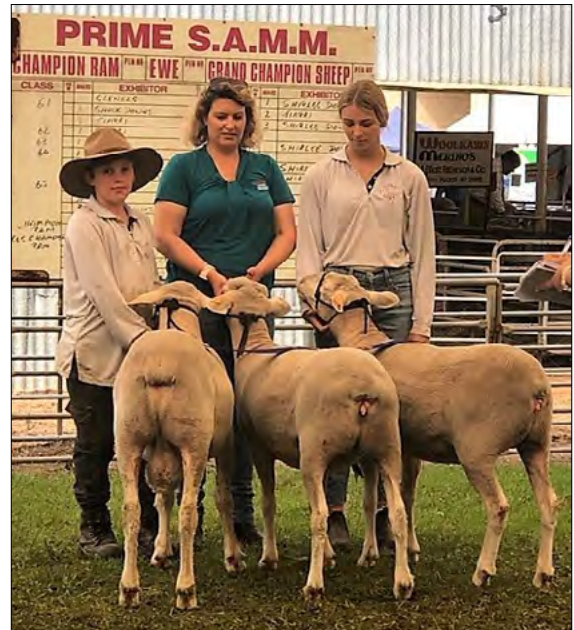
1st place Progeny group 2019 Wagin Woolarama