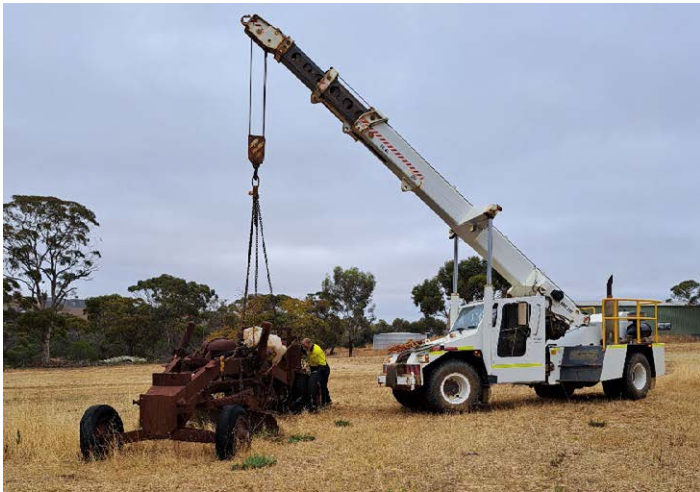
Lonely and weed infested in temporary storage in Queen Street....