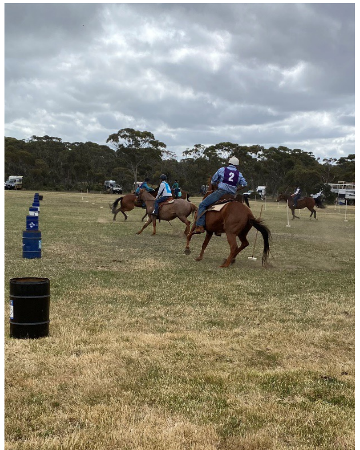
■ Competitors in the Open round the poles almost in unison during a bending race.