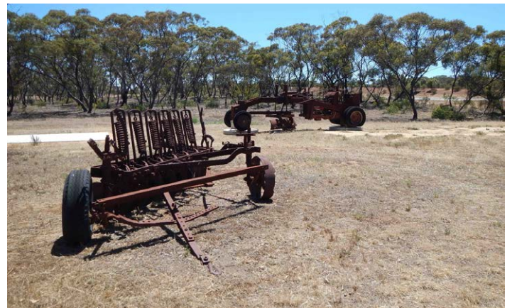
...now finds a new home with old friends at the former Railway Station site.