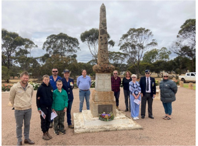
Remembrance Day 2023 in Ravensthorpe.

Every year at the 11th hour of the 11th day of the 11th month, millions around the world pause in silence to remember the sacrifices many have made so we can enjoy life today.