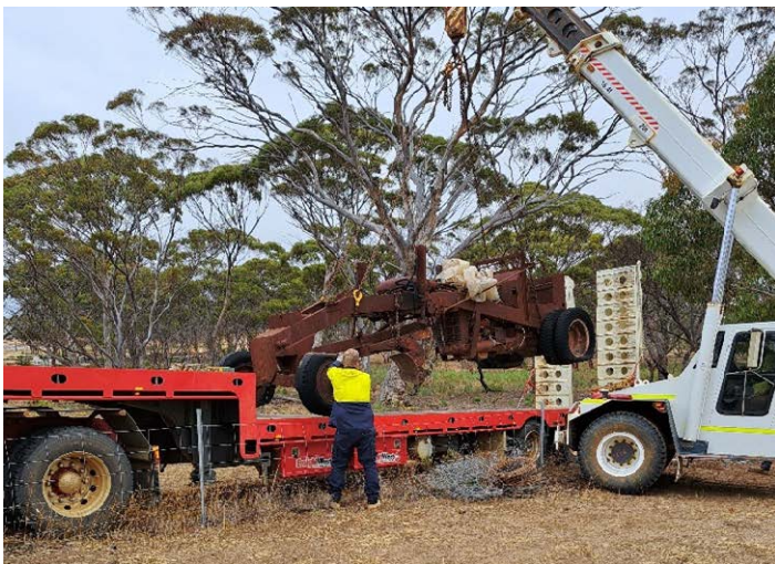
...lowered gently on to the Shire low loader